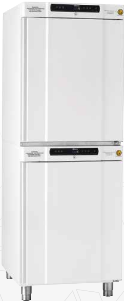
BioCompact RR210 / 210

The BioCompact 210 / 210 is a general purpose combination refrigerator and/or freezer cabinet with a small footprint, designed for a wide range of basic biostorage purposes where the prime focus is on dependability and exceptional performance.