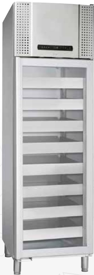
BioBlood BR500. Drawers are optional extras.

The BioBlood 500 design is customised to meet the special requirements associated with the controlled storage of blood, plasma and blood-related products.