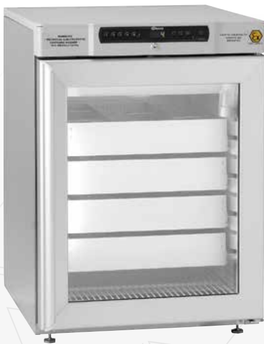
BioCompact II RR210. Drawers, reference container and glass door are optional extras.

Available in either white or stainless steel finish, with a one-piece moulded PS inner lining. Shelves and drawers are mounted in U-shaped rails moulded into the plastic walls.