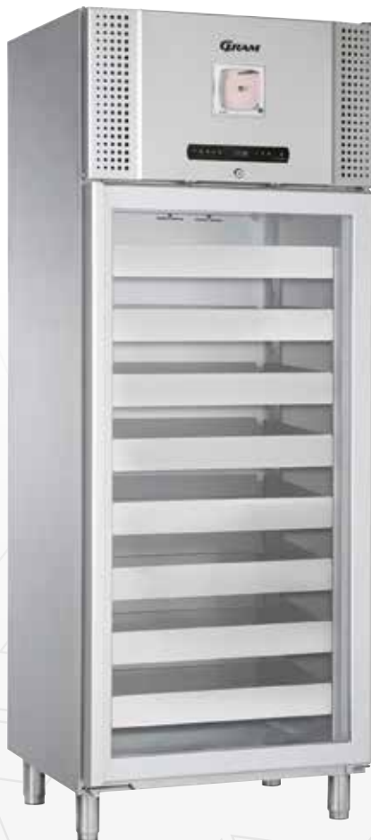
BioBlood BR660W Drawers and chart recorder are optional extras.

The BioBlood 600/660W design is customised to meet the special requirements associated with the controlled storage of blood, plasma and blood-related products.