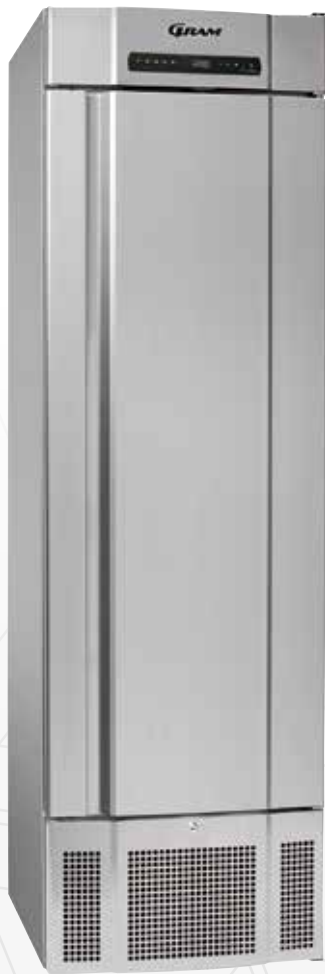
BioMidi EF425. Drawers are optional extras.

The BioMidi EF425 cabinet is a low temperature freezer that operates in the temperature range -5/-40 °C. It is a high capacity ventilated refrigeration unit that makes sure the interior quickly returns to the specified temperature after the door has been opened.