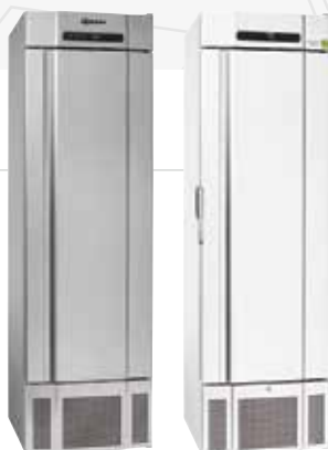
The BioMidi EF425 is available in either white or stainless steel finish. All models come with selfclosing door.

The functional design ensures easy, ergonomically correct access to the storage space.