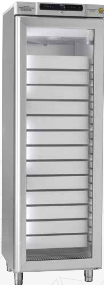
BioCompact II RR410. Drawers, glass door and reference container are optional extras.