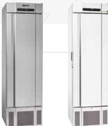
The BioBlood PF425 is available in either white or stainless steel finish. All models come with selfclosing door.

The functional design ensures easy, ergonomically correct access to the storage space.